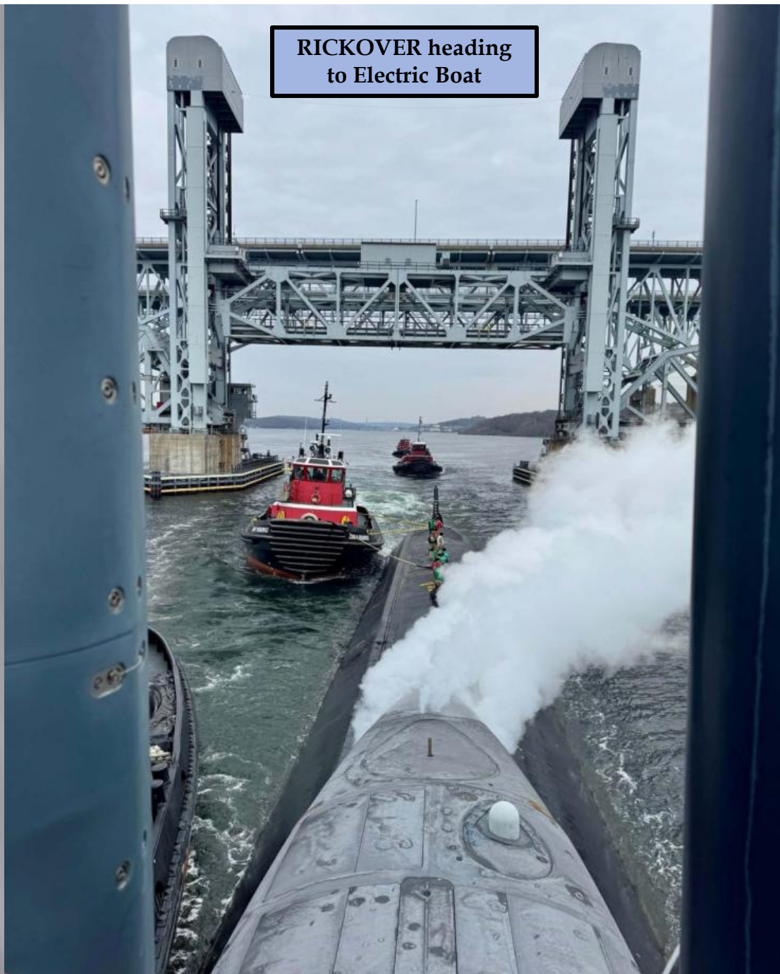
RICKOVER heading to Electric Boat