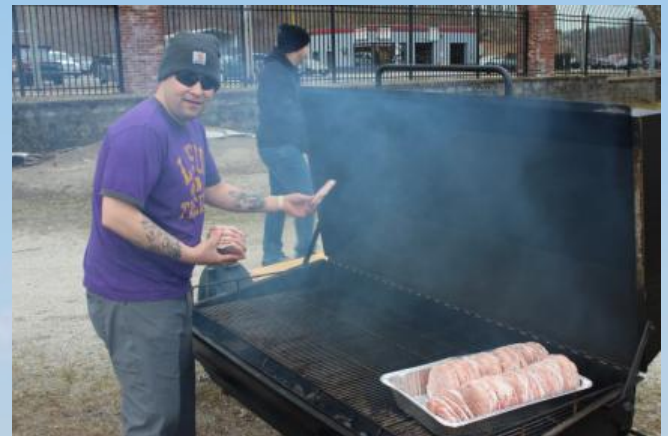
TMC cooking it up!