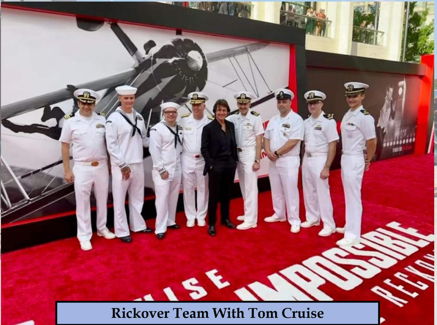
Rickover Team With Tom Cruise