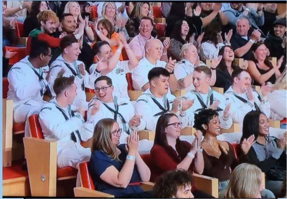
Rickover Team on the Jimmy Fallon Show