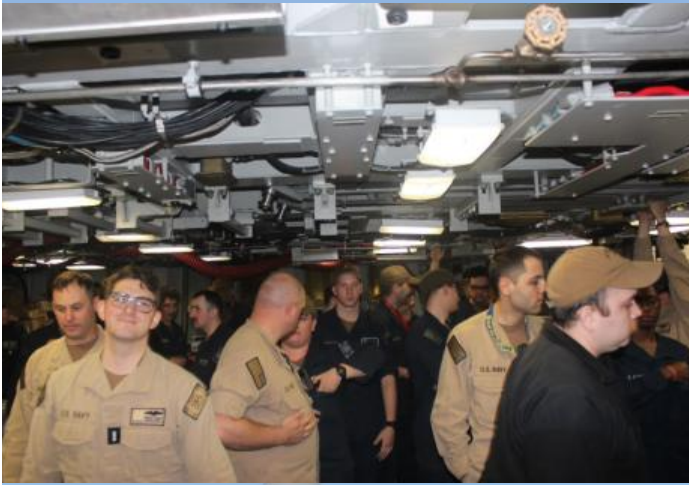
All Hands in the Torpedo Room