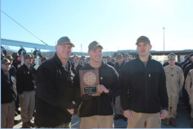
Engineering Red "E"