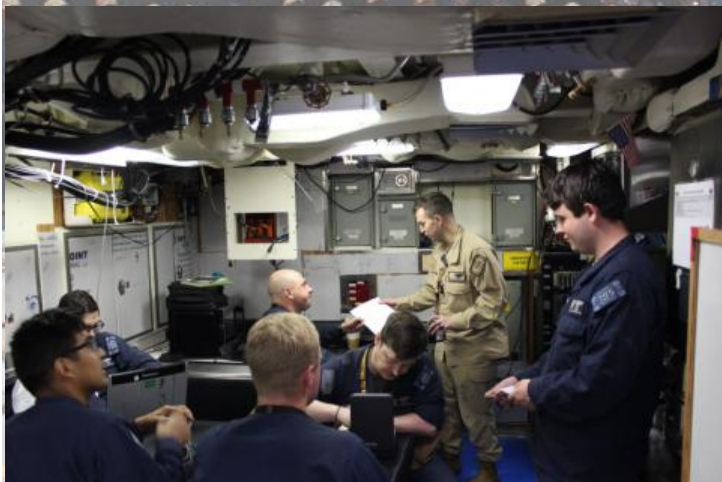
Ready for lunch?