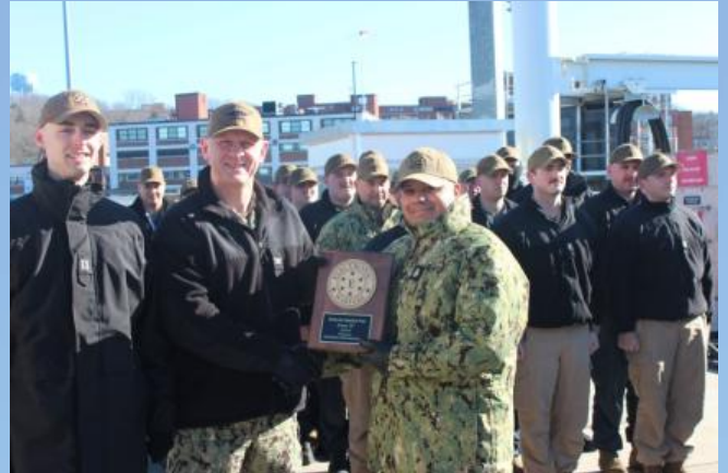
Electronic Warfare Green "E"