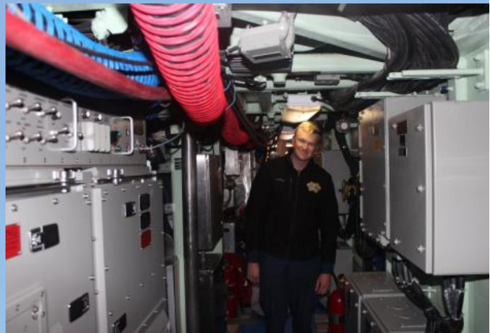
Tall man coming through