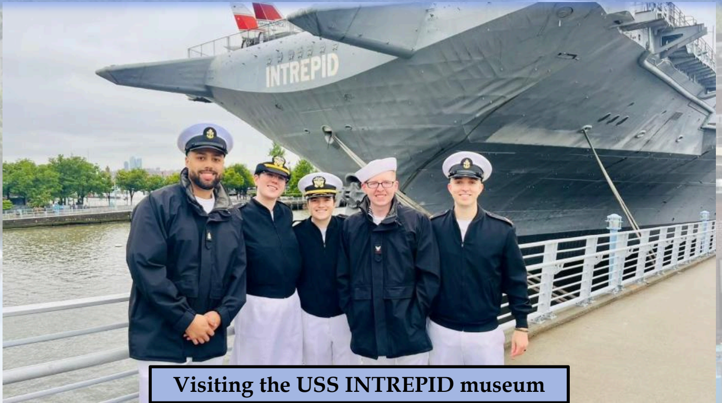
Visiting the USS INTREPID museum