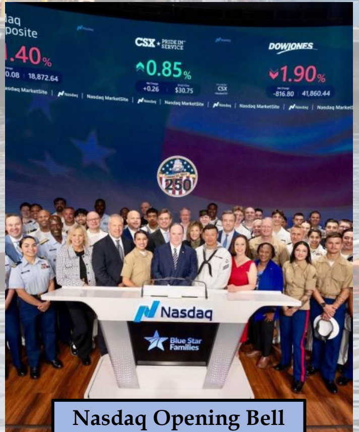
Nasdaq Opening Bell With SECNAV