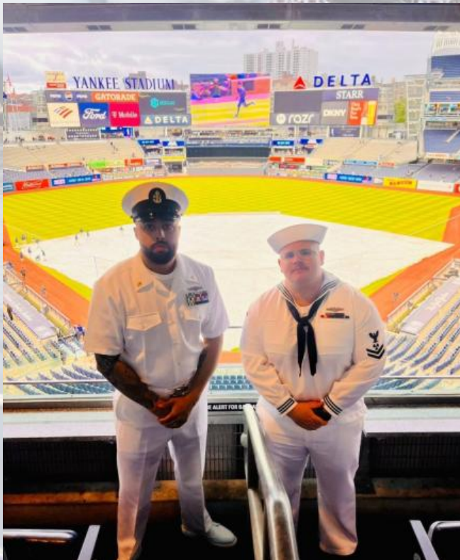
Early Access to Yankee Stadium