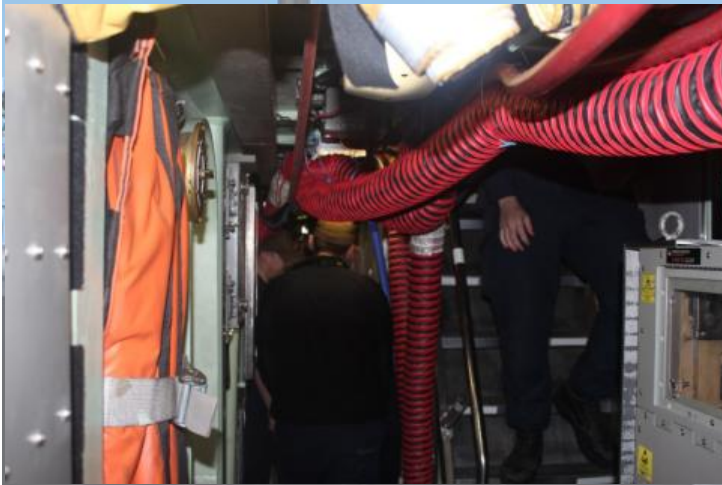
Lots of work going on!