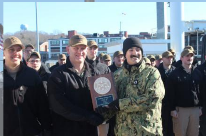
Weapons White "W"