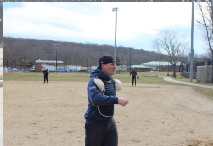
Final game with COB