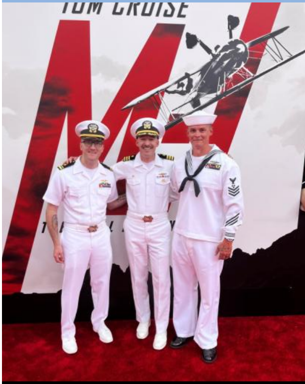
On the Red Carpet